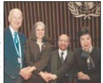
W.B. (Bill) Boyd President, Rotary International

We know that the only way to protect every child from polio is to eradicate it completely. The strategies and tools are known, and health experts agree that the challenges to stopping the spread of polio can be met. Since Rotary was the first organization to have the vision of a polio-free world, we need to sustain our commitment to creating a world with one less threat for every child.