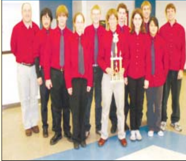
First Place Winners