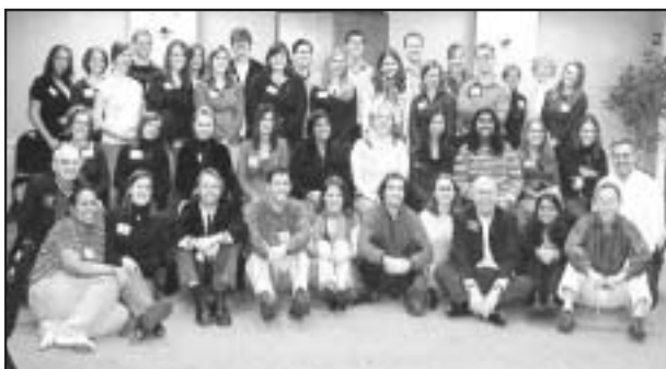
group of Ambassadorial Scholars from the Midwest at their orientation in Kansas City

Tanzania, my first glimpse of life outside the United States and in the developing world. Later that year, an experimental program at Knox's Green Oaks field station gave me the opportunity for one term to live as a commune with students and faculty and study the human role in Nature. Both these experiences tested my strengths and made me aware of the real connection between us and the earth. After Knox I had the oppor-