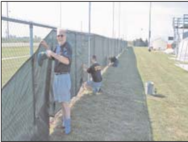
(Left) Members of the Morton Rotary Club working on the wind-screens at McClallen Park soccer complex east of the village.

In addition to cash donations, the club members also gave hundreds of hours in time at the Morton Pumpkin Festival in September. Rotarians volunteered in the three ticket booths on the festival grounds and proudly wore "Rotarians at Work" t-shirts to promote the club.