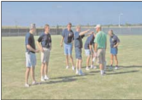
(Right) Members of the Morton Rotary Club discuss the plans for the McClallen Park soccer complex east of the village, which will be renamed, "Rotary Field."