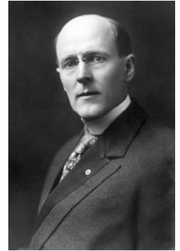
Paul P. Harris (1868-1947) The Founder of Rotary

When President emeritus Paul Harris passed away on 27 January 1947, his dream had grown from an informal meeting of four men to some 6,000 Rotary clubs developed for the purpose of service and fellowship.